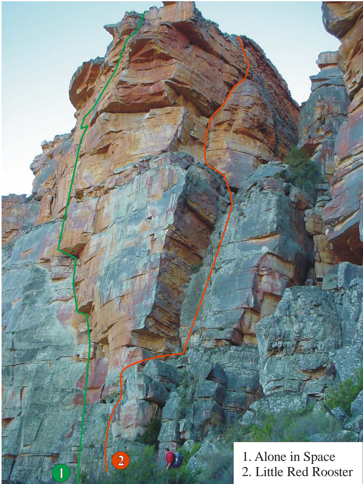
1. Alone in Space 2. Little Red Rooster

All of the routes in these photos have been drawn using my calibrated eyeball looking at poor quality original route descriptions in black and white. I have not climbed most of these routes, so there is every chance I have got it wrong in places. Use it as a guide to the general area where the routes start and go, not as a definitive guide to the exact line to follow. Use it in conjunction with actual route guides to hopefully help you to find the line you want to climb with greater ease.